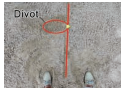
Place your divots ahead of the ball

Practice in a fairway bunker : mark with a line the center of your stance, and practice placing your divot left of that line. This exercise will help you relax through the ball, as you are not so afraid of hitting the ground with your club. Make sure you finish your swing all the way through, in a normal finish position, and check that the divot goes in the direction of your target.